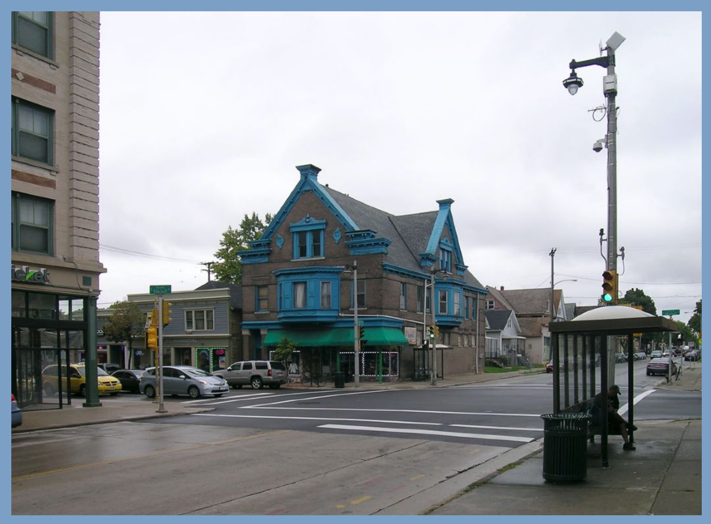
Todays neighborhood-Corner of 6th & Mitchell