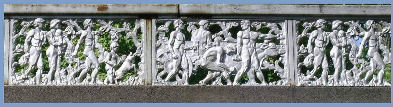
Todays neighborhood-Detail on a bridge connecting Forest Home Cemetery and Greenwood Cemetery on Cleveland Ave.