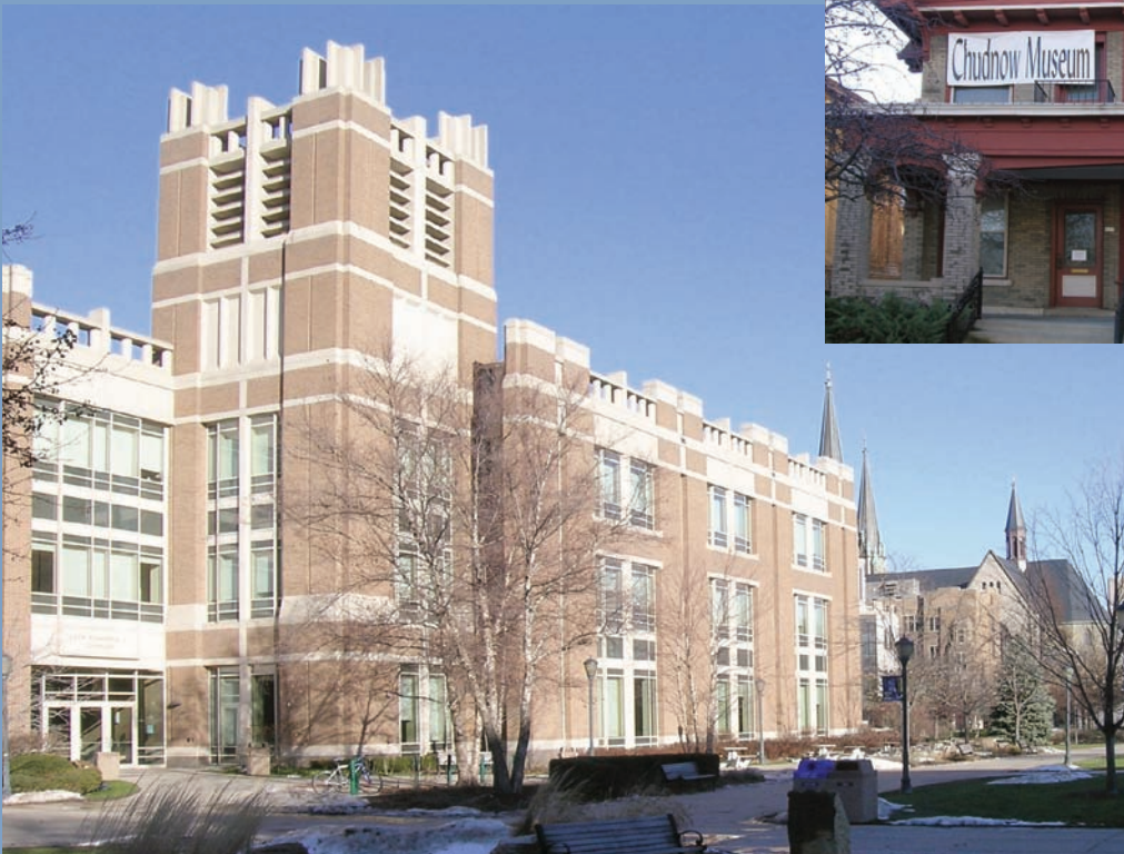
Today's neighborhood-Buildings on the Marquette University campus