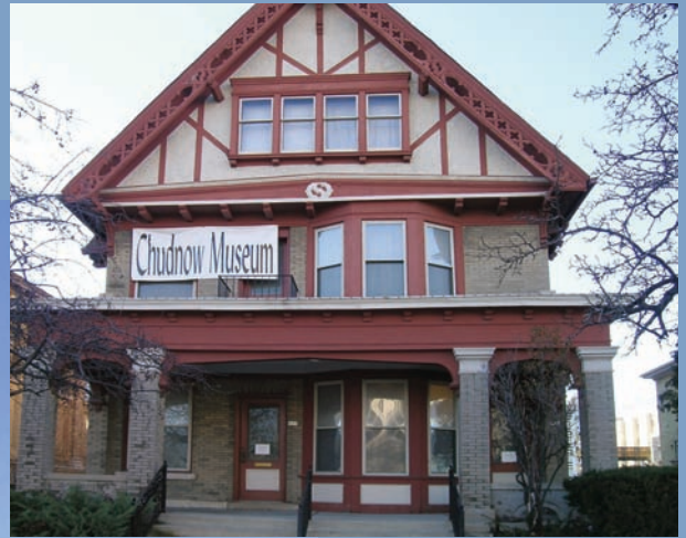
Today's neighborhood-The Chudnow Museum