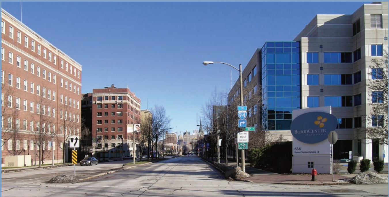
Today's neighborhood-Wisconsin Avenue looking east to downtown