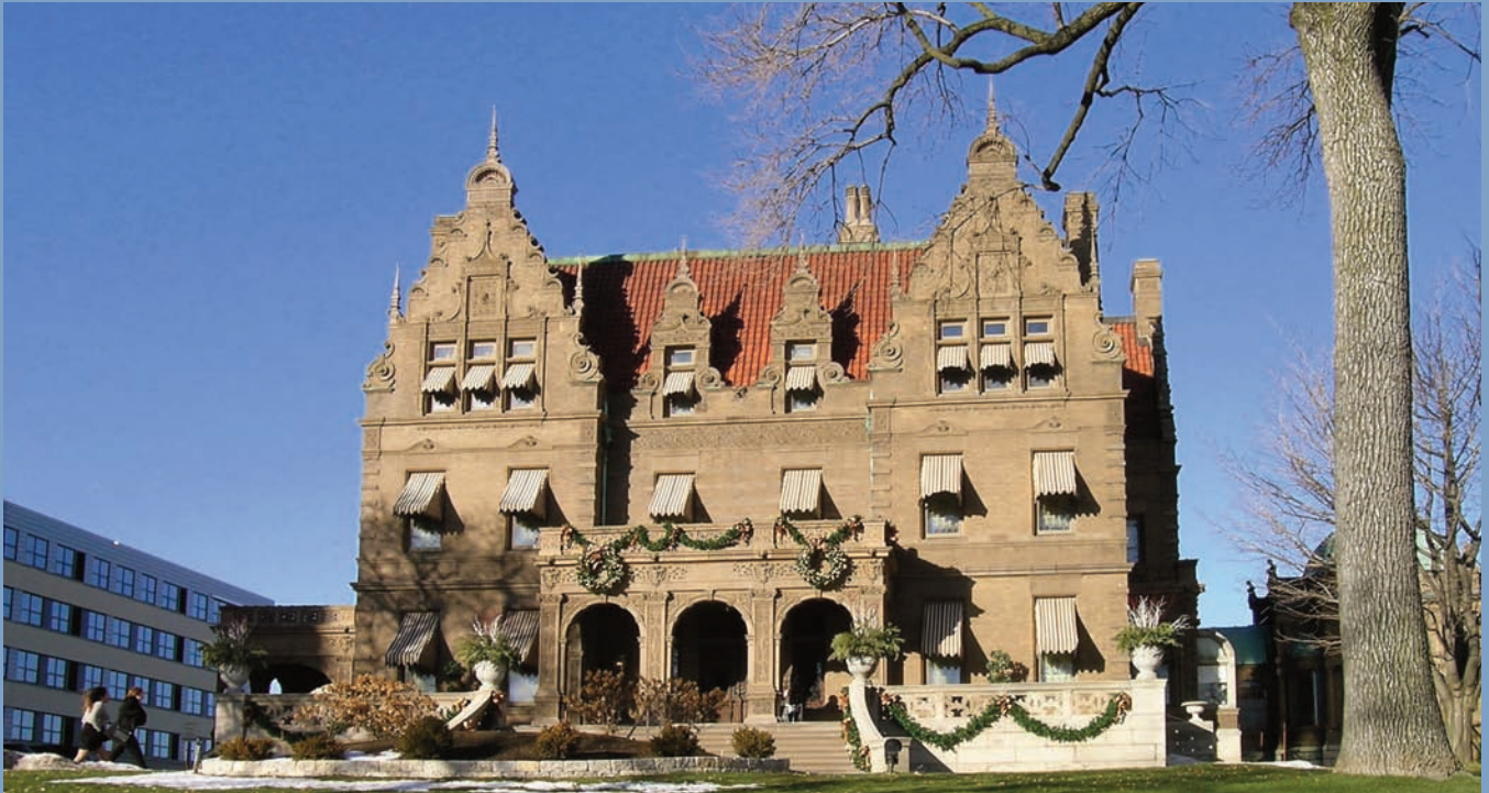
Today's neighborhood-The Pabst Mansion