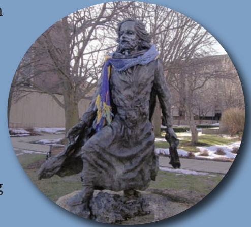
Today's neighborhood- Statue of Father Marquette (scarf probably not sculpted)

One resident of this neighborhood went on to attract considerable attention across the country in the world of entertainment. See his profile on the following page.