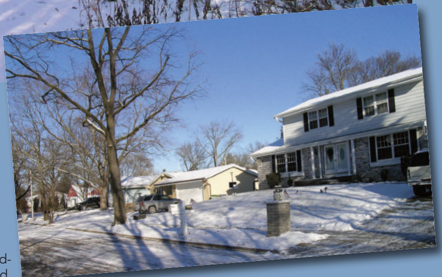
Today's neighborhood- Houses on N. 102nd St. & W. Bender Rd.