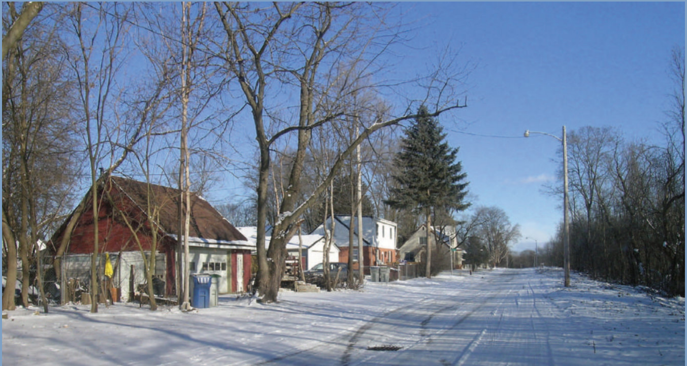
Today's neighborhood-Houses on N. 106th St. & W. Lynx Rd.

i Photo attribution: https://www.facebook.com/pg/virdumarus/about/