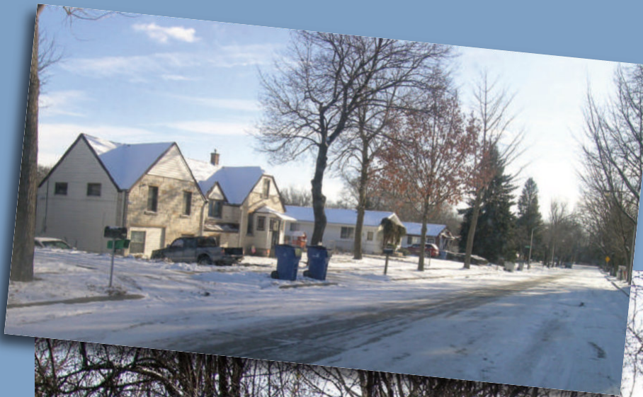
Today's neighborhood- Houses on N. 102nd St.