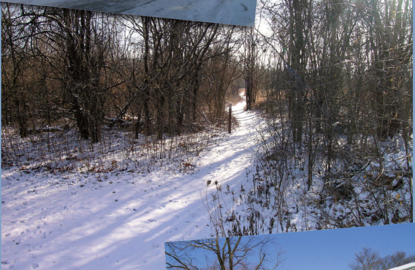
Today's neighborhood- View looking south at the end of N. 102nd St.