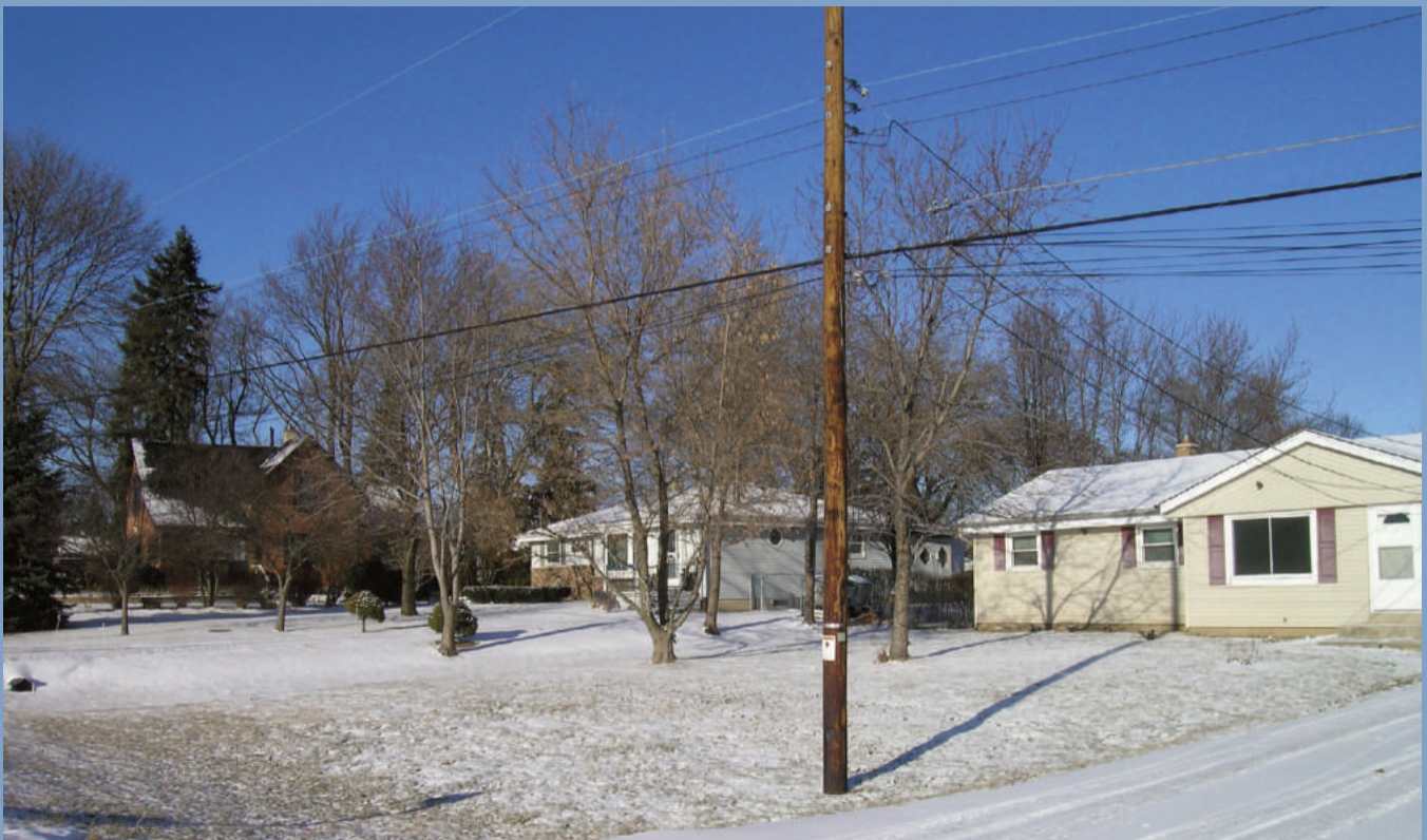
Today's neighborhood-Houses on W. Appleton Ave.