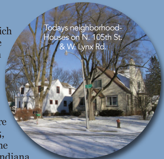
Today's neighborhood- Houses on N. 105th St. & W. Lynx Rd.